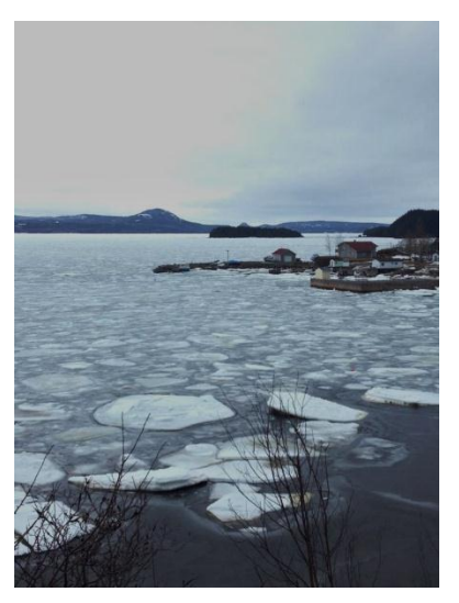
"This is my favourite place to go out in boat to in my town of Springdale!"