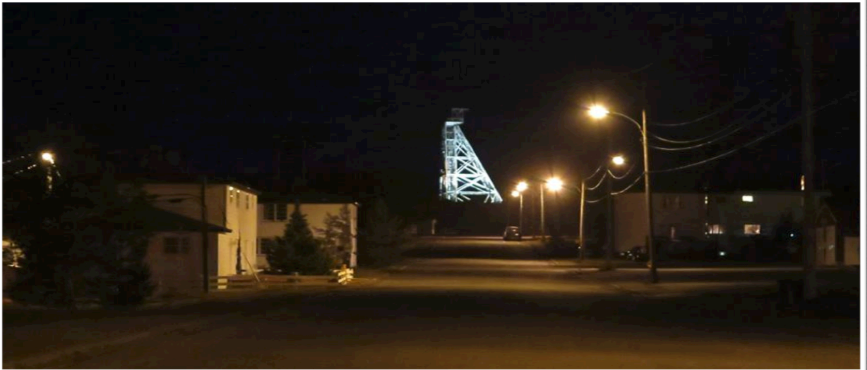
The Deckhead stands illuminated atop Main Street, Buchans.