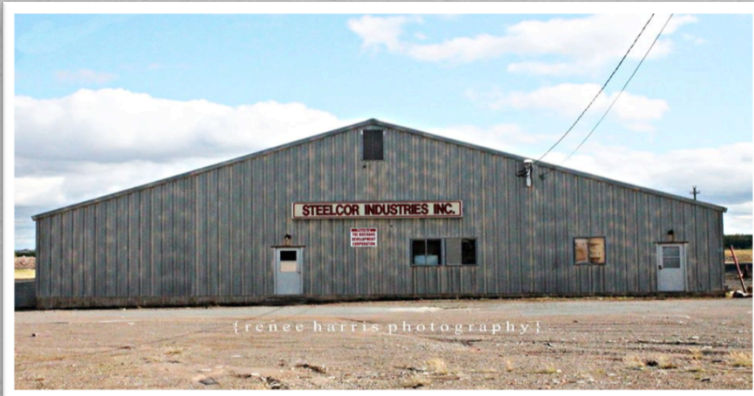
Steelcor Industries, former ASARCO property.