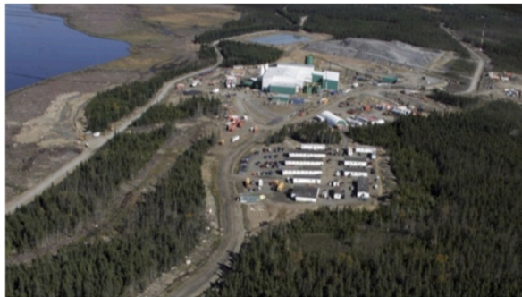
The Duck Pond Mine, located near Millertown in central Newfoundland, will shut down in the spring of 2015.

CBC News Posted: Jan 24, 2014 2:37 PM NT | Last Updated: Jan 24, 2014 4:18 PM NT