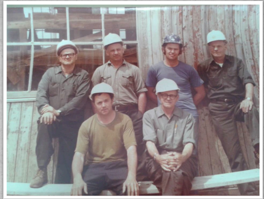
Carpentry shop men.