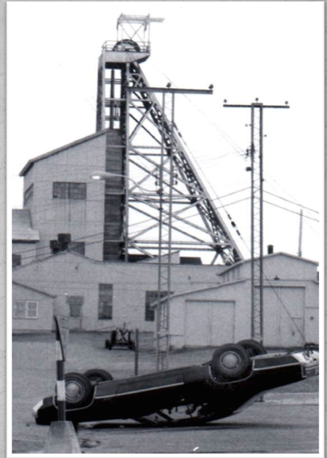
"Four wheels up in the air".