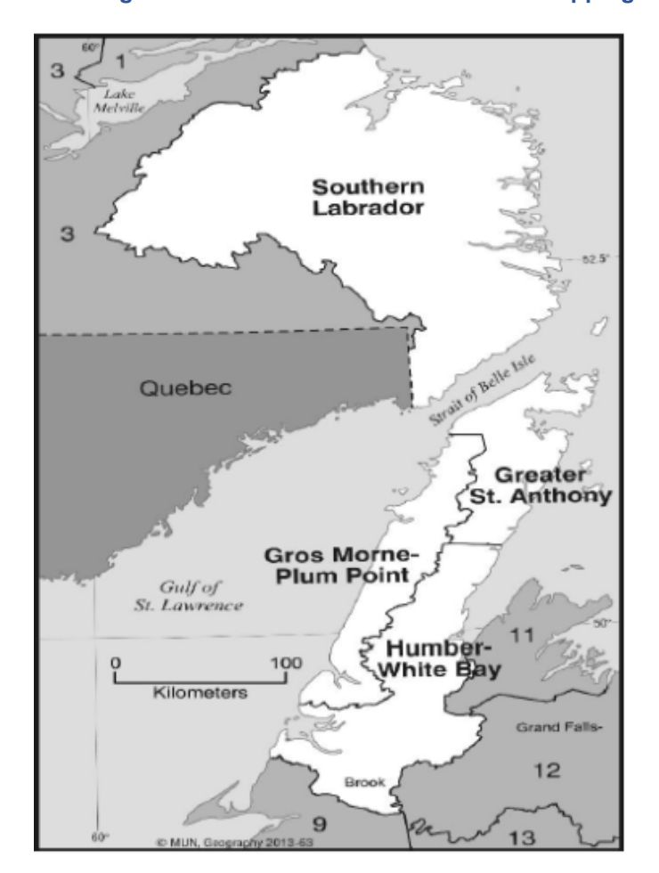
Figure 1: Sub-regions examined in 2014 ACOA asset mapping study.8

Within each of these sub-regions, the project identified local assets according to the Community Capital Framework, a widely used model for sustainable community development that considers how development can balance multiple priorities for local well-being.9 These priorities are represented by various forms of 'community capital', which considered different categories of community resources that can be measured. 10