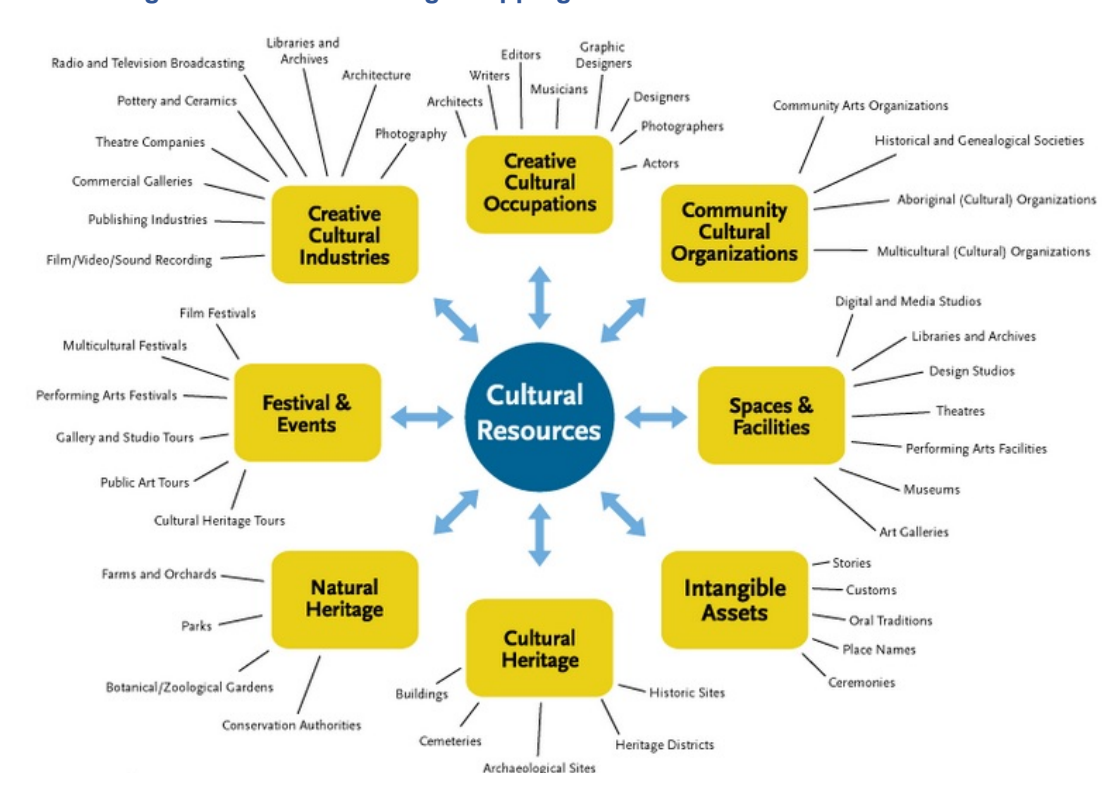
Figure 7: Cultural Heritage Mapping Framework used in Branch.<sup>72</sup>

However, the primary initiative that is examined in this study is a project called the Cultural Heritage Resources (CHR) Inventory, which was a collaboration between the Town of Branch, the Avalon Gateway RED Board (Zone 18), Memorial University researchers, and the NL Department of Finance. 70 The project focused on the Branch, a community of 230 residents on the St. Mary's Bay shore of the southwest Avalon. This initiative was introduced as a pilot project for inventorying cultural assets with the intention for integrating these assets into the System of Community Accounts of Newfoundland and Labrador (www.communityaccounts.ca). The framework used to identify cultural assets in Branch was adapted from a Municipal Cultural Planning Toolkit produced by the Province of Ontario, which outlined different categories of cultural heritage that could be catalogued at the community level. 71 The framework used in the CHR project is pictured below in Figure 7.