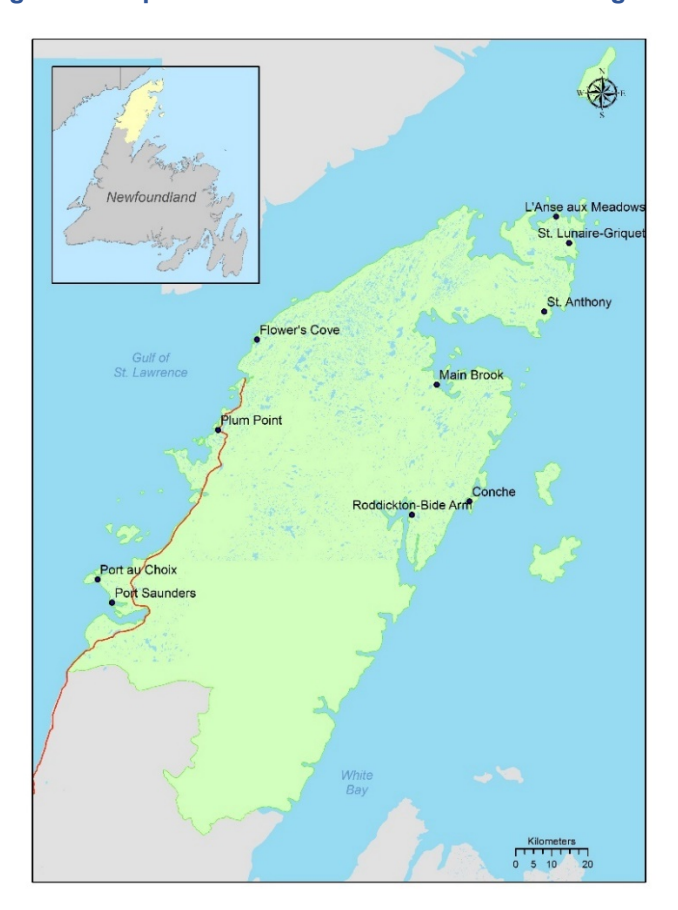
Figure 3: Map of the Great Northern Peninsula Region. 49

analogous with the former St. Anthony-Port Aux Choix Rural Secretariat region, with a land mass of 10,471.53 km². The population density of the region is 1.08 residents per km², making it the most sparsely populated region examined in this study. The nearest urban area is Corner Brook, which is between 285 and 475 km south. The key sectors in the region are healthcare and social assistance, which employs 16.1% of the regional workforce, manufacturing, which employs 13.4%, and natural resources, 12.5%. Fish harvesting and processing remain important sectors in the region, as well as forestry and tourism. Between 2011 and 2016, the regional population declined by 7.6%, and the median age is 52. The unemployment rate of the region is 37.3%. The boundaries of the region are shown in Figure 3 below.