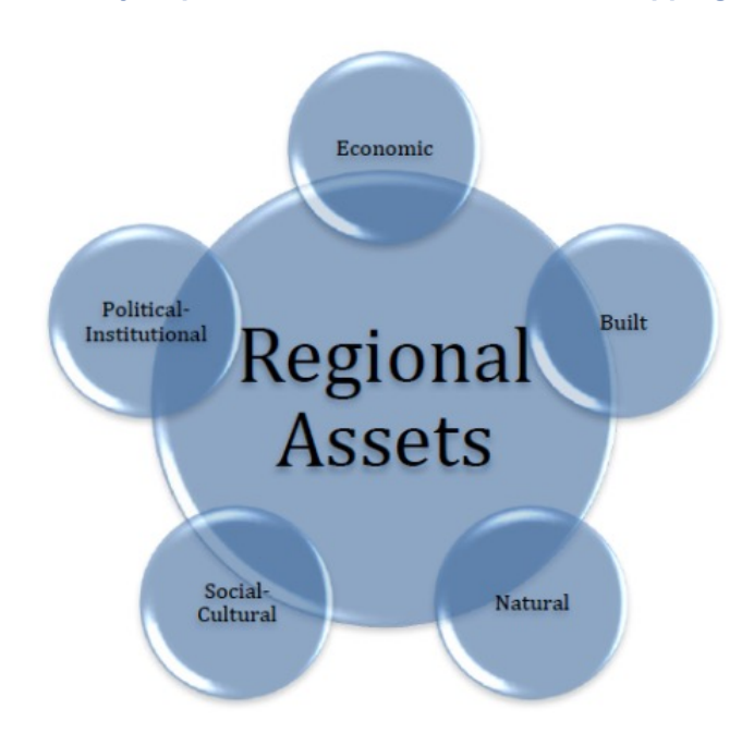
Figure 2: Community Capital Model used in 2014 Asset Mapping Study.

The Western NL Asset Mapping Study catalogued community assets in six categories: built, economic, natural, human, socio-cultural, and political-institutional capital. Relying on an extensive collection of secondary data supplied from regional organizations and other sources, the project also consulted local stakeholders in each sub-region to ground-truth the resources compiled and incorporate local concerns into the process. The result was an extensive asset inventory that listed a wide range of community assets ranging from local infrastructure to wildlife habitats.