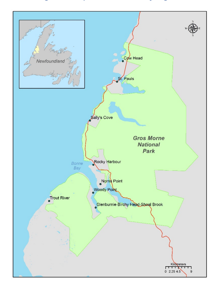
Figure 4: Map of the Bonne Bay region.

declined by 5.1%, and the median age is 53. The regional unemployment rate is 38.0%. The Bonne Bay region is depicted in Figure 4 below.