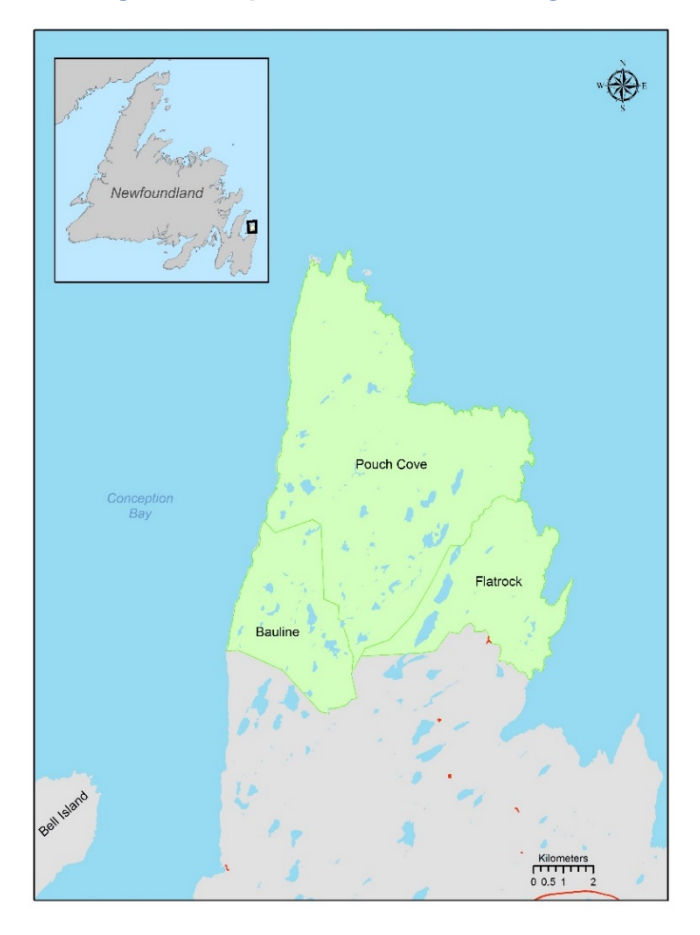
Figure 8: Map of the Killick Coast region.