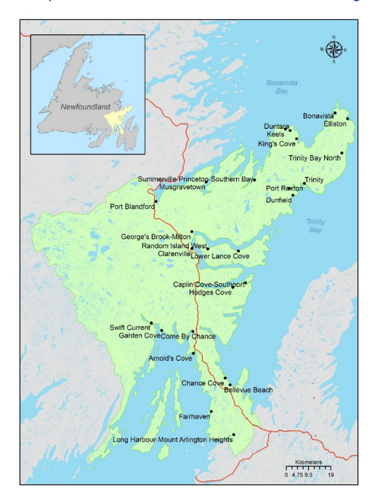
Figure 5: Map of the Clarenville-Bonavista Rural Secretariat region.