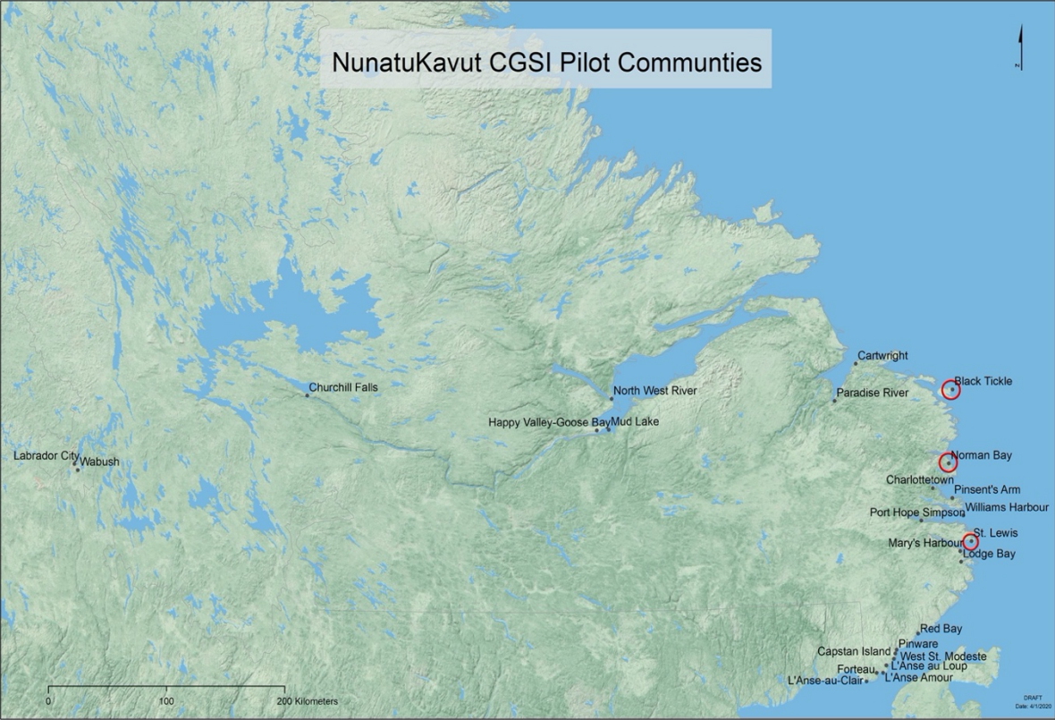
Map of Study Pilot Communities