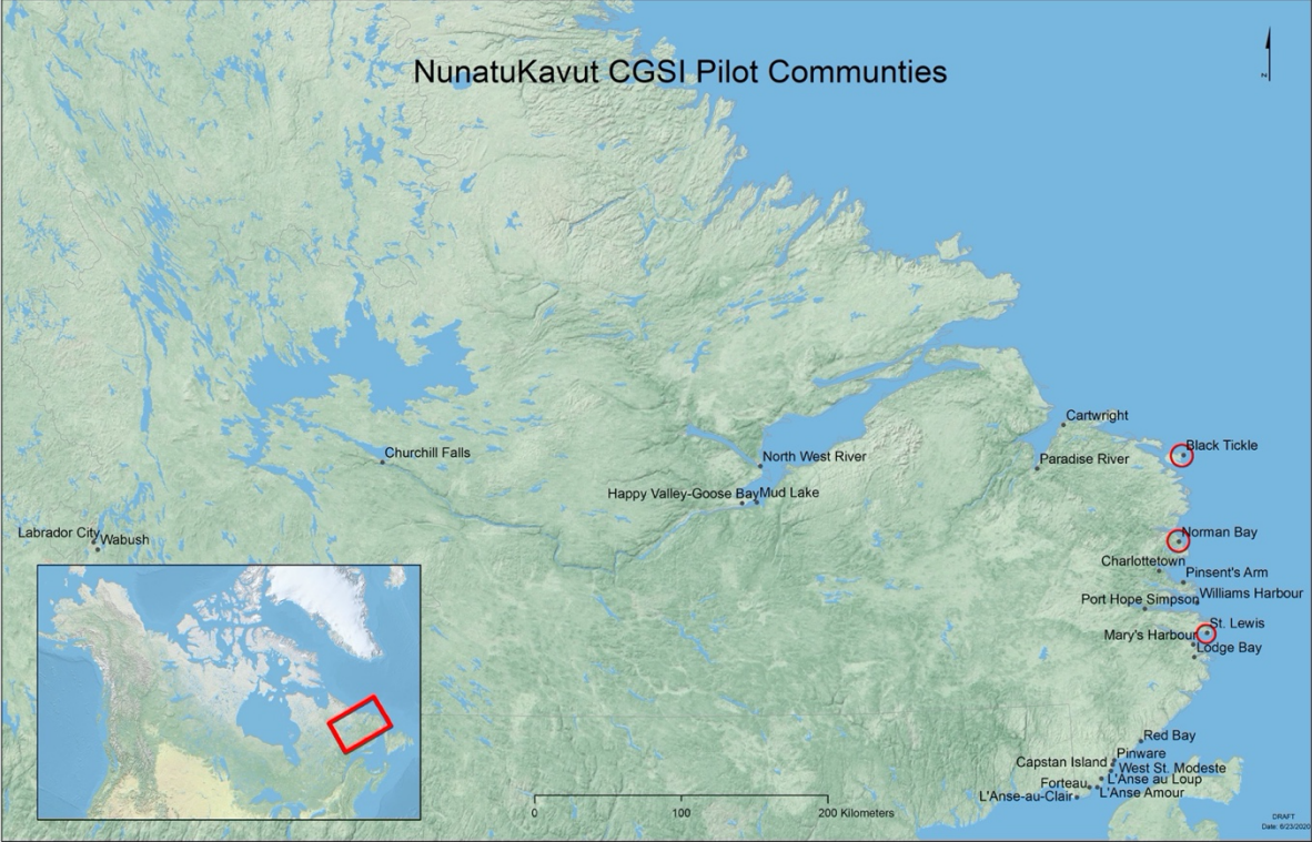
"NunatuKavut CGSI Pilot Communities" Map produced by Bryn Wood, NunatuKavut Community Council, 2020.

Overall, the data collection activities resulted in a compilation of rich knowledge and expertise from Inuit in this study. I organized this knowledge into four themes and two principles of Inuit governance. I present them after a review of modern treaty making in Canada. This review helps to situate a history of colonially rooted governance practices in Canada generally and its