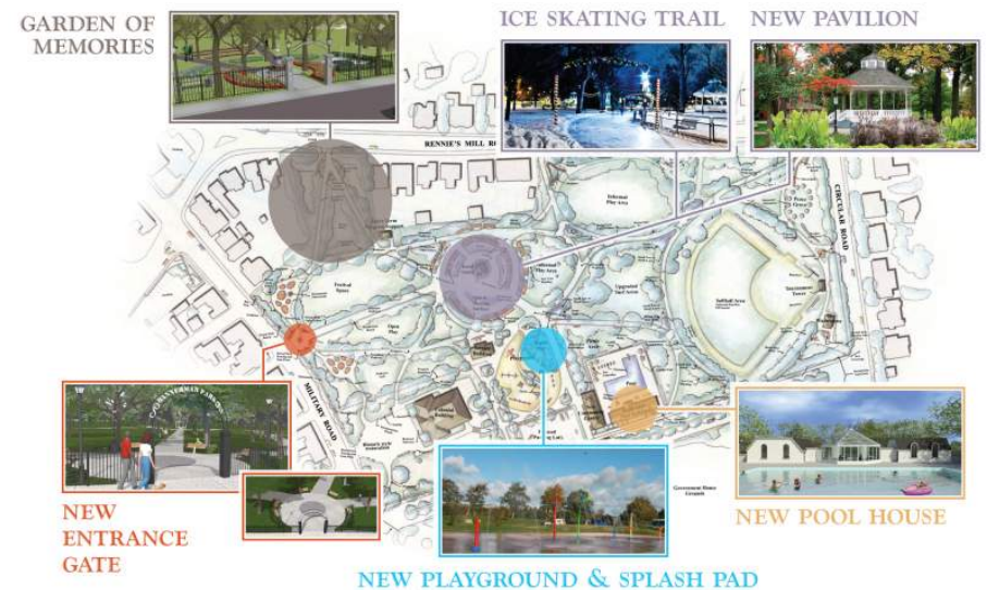
Image Source: http://www.stjohns.ca/living-st-johns/recreation-and-parks/parks-playgrounds-and-trails/bannerman-park

Source: Bjork, 1981; Chen et al, 2005; Kim, 2011